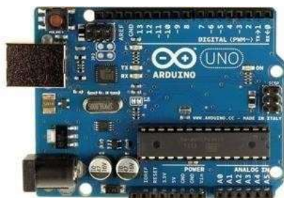
Prototype of Arduino Uno

The Arduino Uno is an open-source microcontroller board based on the Microchip ATmega328P microcontroller and developed by Arduino.cc. The board is equipped with sets of digital and analogue input/output pins that may be interfaced to various expansion boards and other circuits. simply connect it to a computer with a USB cable or power it with a AC-to-DC adapter or battery to get started.