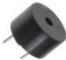
Prototype of Buzzer

electromechanical system which was identical to an electric bell without the metal gong (which makes the ringing noise).