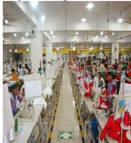
Figure -1 Analysis of seam strength

The effect of polyester/cotton core spun thread of different linear density on seam strength of lock stitch, chain stitch and over edge stitch for single jersey, rib & interlock fabric. The results revealed that all mentioned stitch types have highest seam strength in double jersey interlock