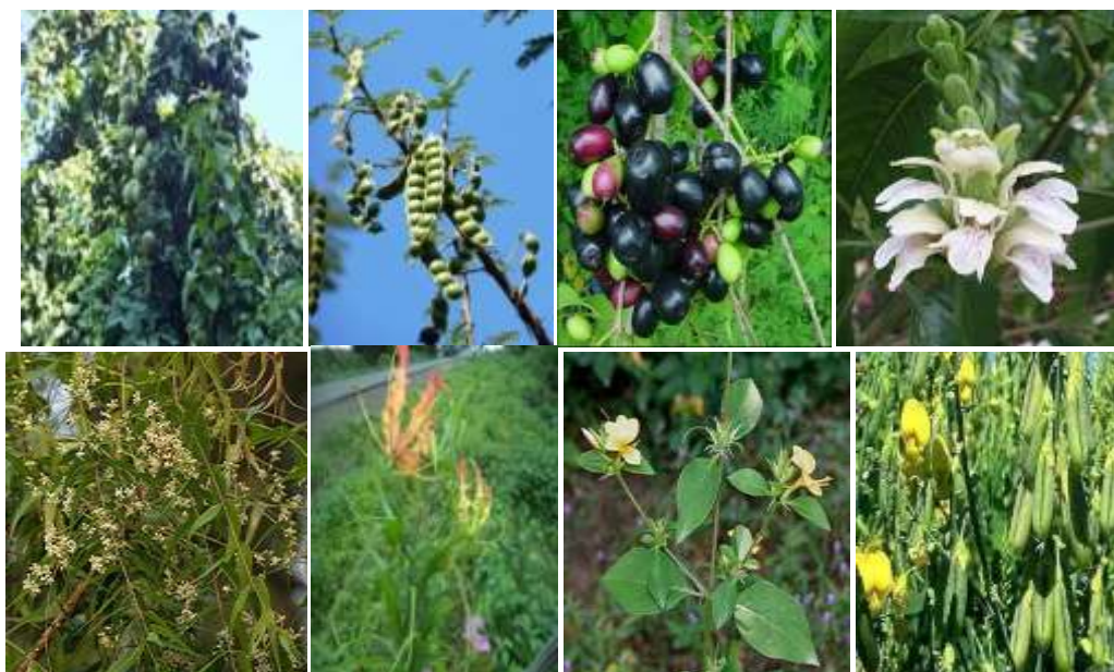
Bael, Babul, Jamun, Adathoda, Neem, Gloriosa, Vajradanti, etc