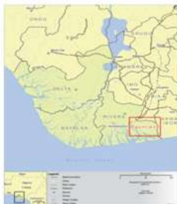
Figure 1 Map of the study area