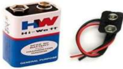
Fig. 3 Battery