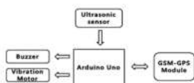
Fig. 9 Block diagram

The microcontroller then processes this data and calculates if the obstacle is close enough. If the obstacle is not that close the circuit does nothing. If the obstacle is close the microcontroller sends a signal to sound a buzzer. It also detects and sounds a different buzzer if it where detects water and alerts the blind. Block diagram totally describes about the complete architecture of the smart cane project. Different sensors how they are arranged and how they implemented can be described in the block diagram. Usually block diagram is a step-by-step process with project requirements.