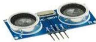
Fig. 2 Ultrasonic Sensor

A ultrasonic sensor is an electronic device that activities the distance of a target thing by releasing ultrasonic sound waves and converts the reflected sound into an electrical sign. • Ultrasonic waves travel faster than the speed of sound that people can hear). Ultrasonic sensors have two principle parts: the transmitter (which discharges the sound utilizing piezoelectric precious stones) furthermore, the beneficiary (which encounters the sound after it has wandered out to and from the goal). To compute the distance between the sensor and the article, the sensor estimates the time it takes between the discharge of the sound by the transmitter to its contact with the property. The equation for this estimation is T \times C (where D, is the distance, T is the time, and C, is the speed of sound.