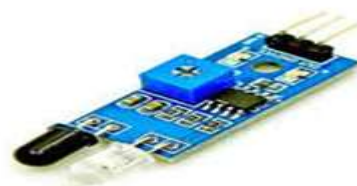
Fig. 6 IR Sensor

IR Sensors is an electronic gadget. It can quantify the warmth of an object and furthermore recognize the movement. For the most part infrared range, all the article radiate structure warm radiations, these sorts of radiations are undetectable to our own eyes. They comprise various sorts of infrared transmitters relying upon the frequency. While estimating the temperature of each shade of light (isolated by a crystal), he saw that the temperature just past the red light was most elevated. IR is undetectable to the natural eye, as its frequency is longer than that of apparent light (however it is as yet on a similar electromagnetic range). Whatever produces heat (all that has a temperature above are casesund five degrees Kelvin) emits infrared radiation. Dynamic infrared sensors both emanate and distinguish infrared radiation. Dynamic IR sensors have two sections: a light radiating diode (LED) and a beneficiary. At the point when an article approaches the sensor, the infrared light from the LED reflects off of the item and is identified by the recipient.