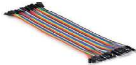
Fig. 5 Jumper wires

Jumper wires are basically wires that have connector pins at each end, permitting them to be utilized to relate two fixations to one another without welding. utilized with breadboards and other prototyping instruments to simplify it to change a circuit dependent upon the situation. However jumper wires arrive in an assortment of shadings, the tones don't mean anything. This implies that a red jumper wire is in fact equivalent to a dark one. However, the tones can be utilized for your potential benefit to separate between kinds of associations, like ground or force.