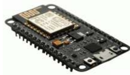
Fig.1 Node MCU

The Arduino Micro Controller is an extremely easy to utilize and installed on an unmarried chip. It is an In-System-Programmable Device this infers the client haven't any need to use the discard the IC, we can without a moment's delay join the Node MCU to the PC and picking the best possible COMM port. The Node MCU has many sorts like UNO, MEGA and numerous others; here we utilize Node MCU UNO board. The UNO board will appear this way.