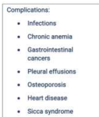
Figure 2: Complications of Rheumatoid Arthritis