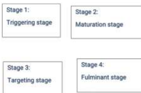
Figure 1: Stages of Rheumatoid Arthritis