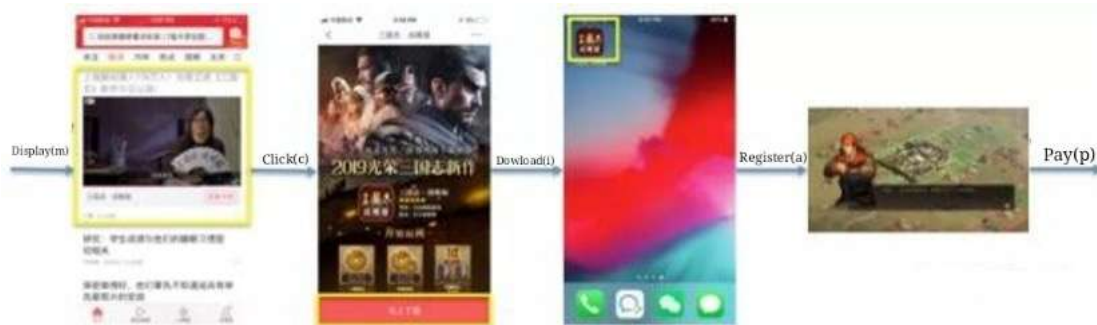
Figure 5-1 General Flow Chart of Internet Information Flow Advertising Revenue

When users open an APP, sometimes they may browse an advertisement (m). Then the user is likely to take the following measures. (1) Click on this ad about APP (c). (2) Download the APP (i). (3) Register after installing the APP (a). (4) Recharge after a period of use (p). (5) Other behavior. See Figure 5-1.