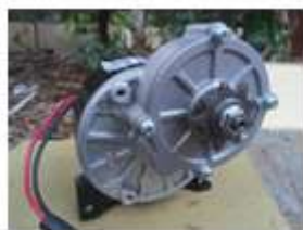
Figure 4- Motor

The motor selected is 24Volt DC motor that gives a power output of 250 Watt. RPM (after Reduction) – 300. Full load current – 13.4A. No load Current – 2.2A Torque Constant – 8N.m (80 kg-cm)