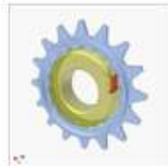
Figure 2 – Clutch mechanism

In Anticlockwise rotation the pawls slides through the ratchet and the power is not transferred only the teeth rotates. Teeth in clockwise movement the ratchet and the pawls engage and the whole system rotates.