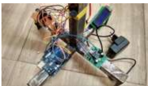
Fig 2 hardware design

position using the spring and again blocks the flow of liquid. During this process, the coil draws a large amount of current and also produces hysteresis problem, hence it is not possible to drive a Solenoid coil directly through a logic circuit. Here we are using a 12V solenoid valve which is commonly used in controlling the flow of liquids. The solenoid draws a continuous current of 700mA when energized and a peak of nearly 1.2A so we have to consider these things while designing the solenoid driver circuit for this particular Solenoid valve.