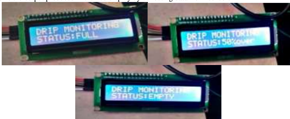
Fig 3 result display on lcd

Fig 3 shows the output produced in the lcd display by collecting data from sensors