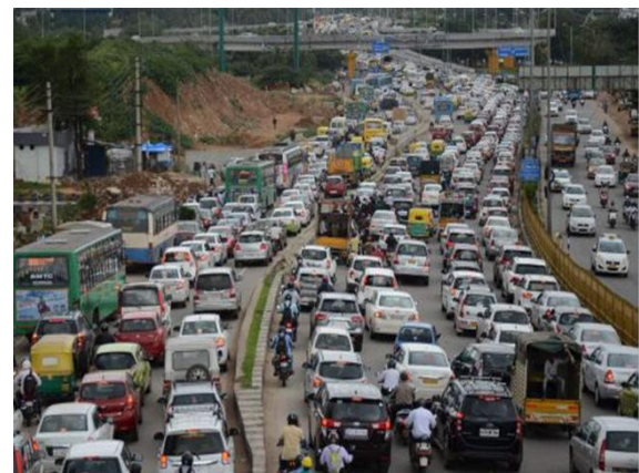
Figure 1. Hebbal Flyover with vehicles stuck via travel to Bangalore International Airport (BIAL)

in area. Overall, India's Silicon city is suffering with serious risk (city metric, 2018) of traffic congestion, short of water supply, clotting of sanitation reserve, deterioration of 1115 parks and 183 lakes, tacking air pollution etc. Architect Naresh Narasimhan (Scmp Business publication, March 2018) believes the doomsday predictions about Bengaluru becoming uninhabitable. With these challenges in Bengaluru, the government is addressing to re-build a sustainable platform with 3 retreat style (sustainability next report, 2019) that is defined as Urban Water, Urban Sustainability and Urban Climate change. The future of this city has higher chances of success in a democratic way.