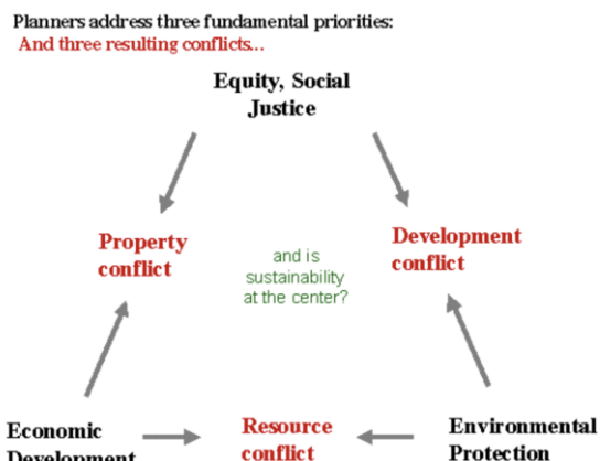
Figure 3. Campbell (1996) Planners triangle. The triangle of conflicting goals and three associated conflicts. Planners define themselves where the predicted position stand on the triangle. The main central point being Sustainability development

Alternatively, as our city have to prioritise on expanding the sustainability measure, which could alter the triangle based on the measured sustainability growth. However the triangle symmetry with three main goals (social, economic and environment) with three conflict (resource, property and development) needs to literate change depending on the unintentional city growth.