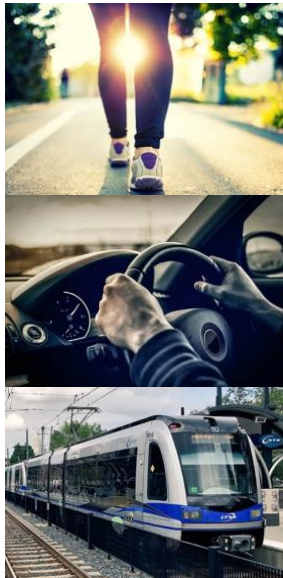
Figure 5 Smart Source of Travel

One quarter of global CO 2 emission is from mobility of citizens and goods. As per WWF's One planet city challenge 2017-18, sustainable transportation creation is one of the biggest opportunities for cities. However, modes like bicycle, pedestrian lanes, electric vehicles, car sharing, and rail freight are few sustainable urban mobility for mitigating climate change and creating climate safe cities.