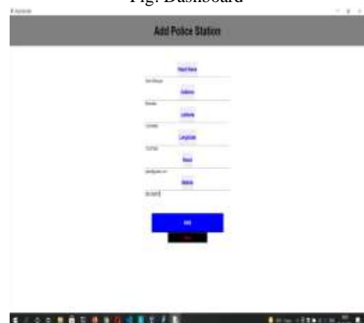
Fig: Add Police Station