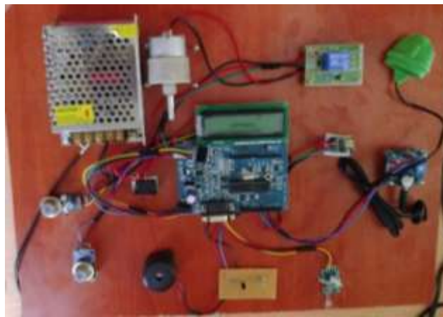
TOP VIEW OF FATIGUE SURVEILLANCE AND SAFETY ENHANCEMENT KIT

abnormal heat movement and the message sleep detected will be displayed on LED and alarm along with vibration motor are activated. The GS 106 and petrol leakage sensor detect the presence of gasses and set alarm along with the indication of gas detected message in LED. The fire sensor (BPV 10) detects the presence of fire and sent the message along with alarm. The IoT module with internet access sent he data for every 7 seconds to the IoT server where the data are stored along with graphical chart.