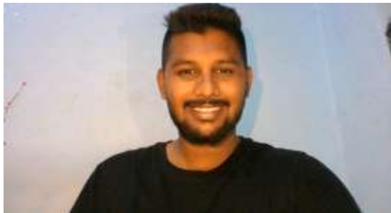
Figure 4.1: Face Recognition-Test Case 1

The face recognition module makes use of raw images as test cases and aims at classifying the faces that are detected within the image. The test cases considered are shown in Figures 4.1 and Figure 4.2. Test Case 1 for Face Recognition aims to test the module for single face images in the video stream while Test Case 2 aims at testing it for multiple face images.