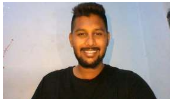
Figure 4.3: Unsuccessful Authentication-Test Case 1

fixed duration is detected as an unauthorized person thus preventing spoof attacks. The live video stream is run for certain time period for user authentication. Referring to Figure 4.3, if the person does not blink his eyes within the given time period it will be detected as “Blink not detected” thus causing the authentication of that user to fail. The Eyes closed test case is tested with live video stream where the live face with closed eyes for a fixed duration will be detected as an authorized person. The live video stream will run for a certain time period in order to authenticate the user. Referring to Figure 4.4 if the person blinks his eyes within the given time period it will be detected as “Authentication successful”. The eye-blink detection method counts eye blinks in the video stream using the 68- facial and marks method. This method uses a metric called Eye Aspect Ratio (EAR) which is the ratio of vertical distance to the horizontal distance. This metric is used to count the number of eye blinks in the video stream. The blink count is then used to determine the live lines of the user thus preventing spoofing.