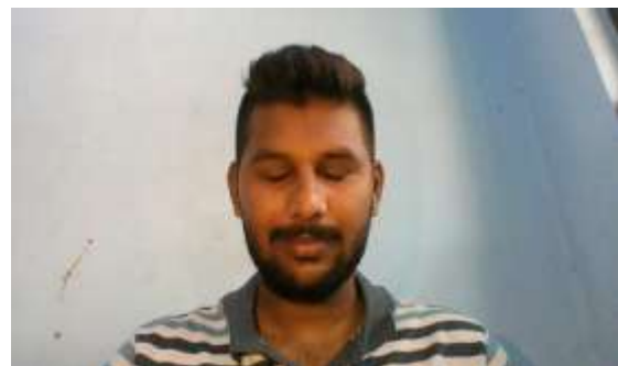
Figure 4.4: Successful Authentication-Test Case 2