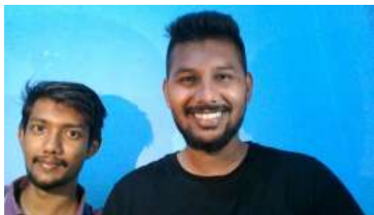
Figure 4.2: Face Recognition-Test Case 2

On the other hand, the authentication module takes the live video stream as input. The different test cases for this module are: