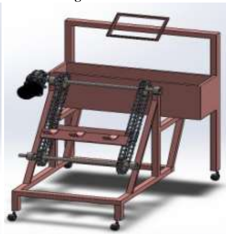
Fig .5 Isometric View