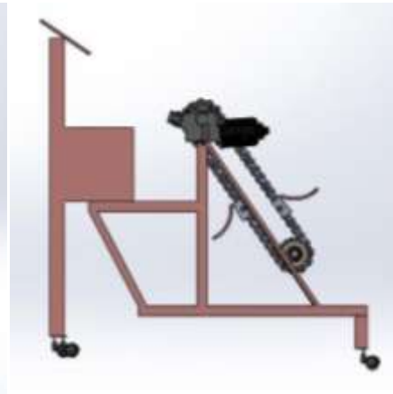
Fig .3 Side View