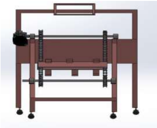
Fig .2 Top View