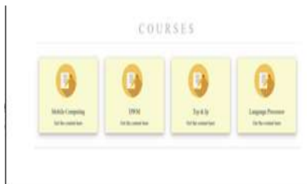
Fig.6: Course section of homepage.

The above fig.4 displays the navigation bar when a user login into the system, the name of the user will be displayed on the navbar. The logout button will be showed with other features.