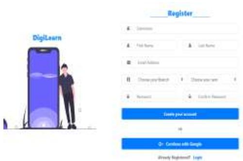
Figure 3. Demo Registration page.

Above Fig.3: Is the Registration form. This module includes various user fields which user must fill up for the successful registration. So that login credentials can be validated.