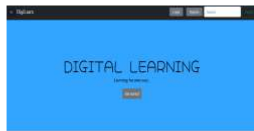
Figure 1. example Landing page.

The Fig.1 shows The Landing page is the example demo of the app which consist of login/register buttons and displaying introductory info.