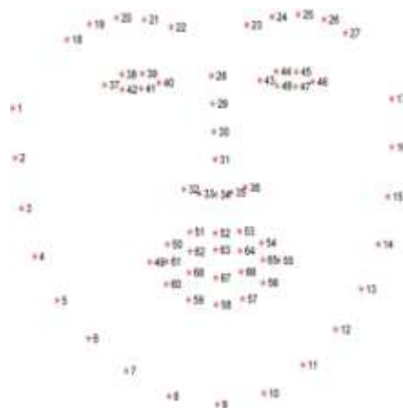
Fig. 2. Landmarks as depicted by dlib facial predictor

The velocity reduction is done in such a way that a velocity sensor is used. The velocity sensor shows the speed of the vehicle. Velocity sensor contains a disc and on at both ends two tyres can be placed. Upon receiving the value as high, the sensor senses it and the motor that is giving velocity starts to reduce.