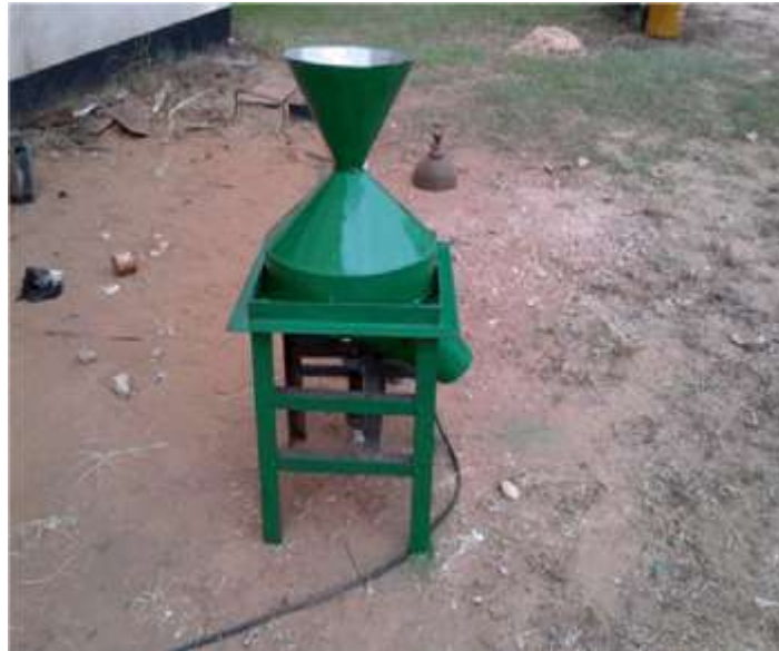
Figure 1. Bambara groundnut Sheller