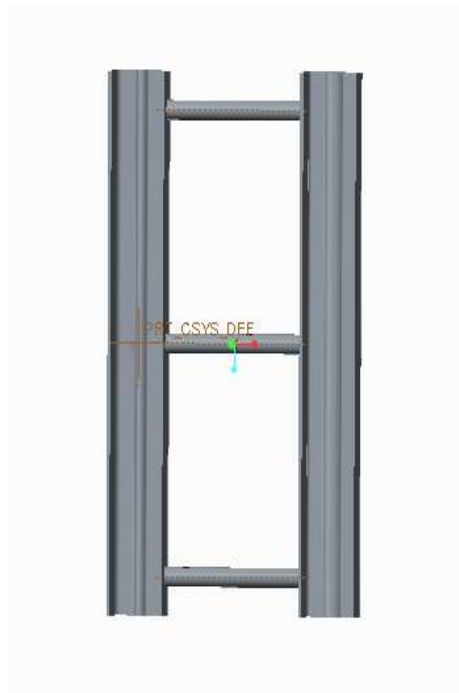
Figure 1 CAD model of Roller Frame

Figures 1 show the isometric view of the final CAD model of the roller frame created after multiple iterations and improvements.