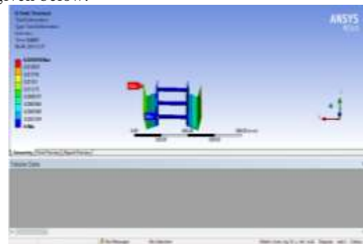
Fig.2 Total Deformation

Then we find out total deformation & von-misses stress. after applying load on roller frame we conclude that designed roller frame can able to sustain this weight without breaking. ansys figures given below.