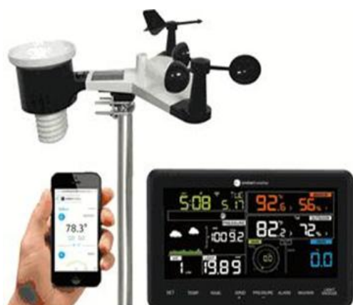
Figure 1.4: WS-2902A

Ambient Weather WS-2902A allows monitoring the atmospheric stipulation which is easy enough to notice with best colour display experience instilled with the LCD. The latest Wi-Fi connectivity allows the transmission of data to the biggest weather station of the world. It gives the contrivance connection between local weather conditions by transmitting the data over internet using smart phone, computer or tablet directly to the end user. The interlinked weather forecasting station measures humidity in air, temperature, and direction of wind, solar radiations, UV and speed of wind.