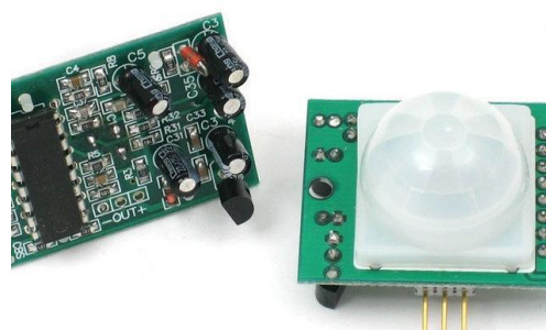
Figure 1.9: PIR Sensor