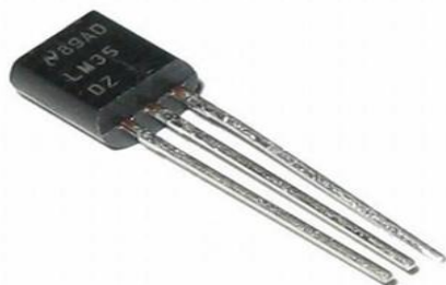
Figure 1.7: Temperature Sensor LM 35

is proven to be useful in agriculture. LM 35 can take up to +150 degrees to -55 degrees.