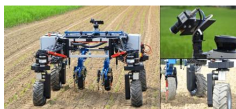
Figure 1.1: Automated Harvest

complex machines with advanced technology shape the daily routine of farming processes. On the contrary, the fields of farming are still designated by multiple manual tasks that include heavy labour. The vision of this paper is to lift the burden of spine-breaking work off the labour’s shoulders using the necessary technology, automation and robotics. Therefore, a scalable and modular agricultural robotic concept that enhances smart farming to the next level is proposed by this paper. As proof of concept the proposed configuration is integrated and validated as the experimental platform FRANC as shown in Fig.1. All experiments are performed in real-life outdoor scenarios as vegetable fields that are sowed or planted in row structures. Therefore, a local navigation system based on a crop row detection system which sets the parameters automatically and enables an adaptable GPS-independent navigation. As reviewed the sensor system consists of two stereo cameras and a NIR camera as shown in Fig.1. A NIR pass filter and the sensitivity of the built-in chip form in combination a band pass filter that enables a detection of light from 850nm to 1000nm. [12].