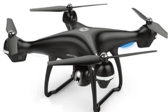
Figure 1.3: HS100 GPS FPV

surveillance. This machine is an intelligent remote-controlled quad copter, fitted with the latest GPS tracking system. The HD 2K camera captures the high-quality aerial footage. Fitted with latest technology of "follow me", this feature make sure the quad copter stays above the user while capturing the movements and keeping track of the user.