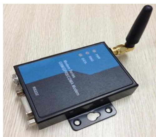
Figure 1.6: GSM Module RS-232

This Global System modem is capable of accessing any SIM network operator and yet can play as a unique SIM number and a mobile phone at the same time. RS-232 protocol is used because it can easily connect to the controller and is integrated via GSM modem. It also sends and receives SMS and make calls. This GSM module is run by 900/1800 megahertz (MHz). It features an LED light buzzer and is protective against tripping voltages.