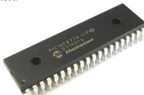
Figure 1.5: Microcontroller PIC-16F877A

removed because of memory flash. Many different industries provide a massive range of applications. This could also be implemented in home appliances, security, industrial advancement and remote sensors. The frequencies, transmitter codes and other related data is also received and stored in a featured EEPROM.