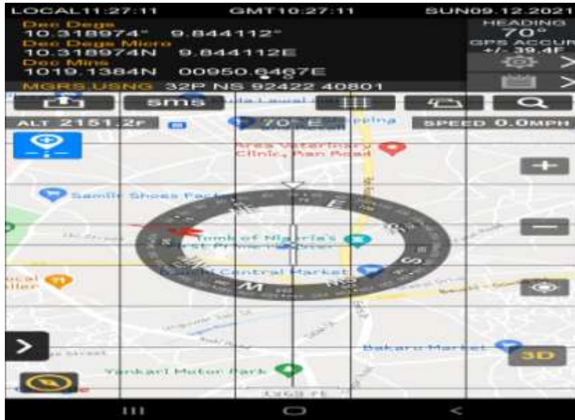
Figure 1: Snapshot of GPS Dragon App