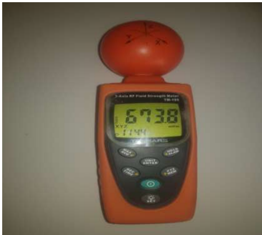
Figure 2: Picture of TM-195 Meter