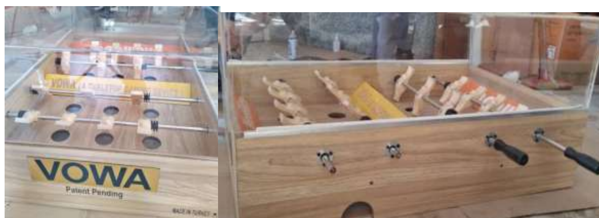
Fig. 1. The final schematic of VOWA

In this paper, we introduce a new exciting entertainment for families of different ages wish is called VOWA. The VOWA is an exercise device that has no similar sample and is sponsored by the United States Patent Office and the Republic of Turkey for 20 years until 2042. The completed form of VOWA is illustrated in figure 1.