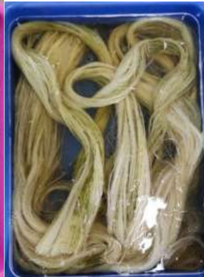
Fig. 4: MCL fibres in water