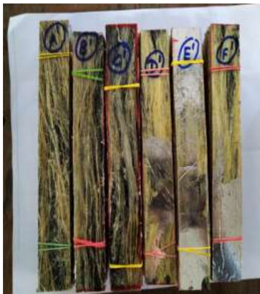
Fig 7: Final products cutted into strips