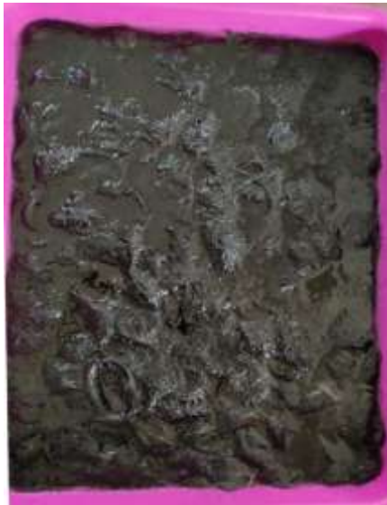
Fig.3: human hair in water