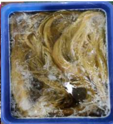
Fig.6: MCL fibres with 10% of NaOH