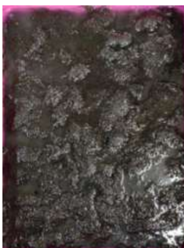
fig.5: human hair with 10% NaOH