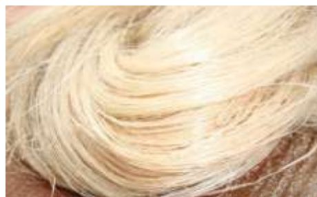
Fig.2.1 Coconut leaf midrib (rachis) Fig 2.2 Coconut fibre obtain from midrib(rachis)