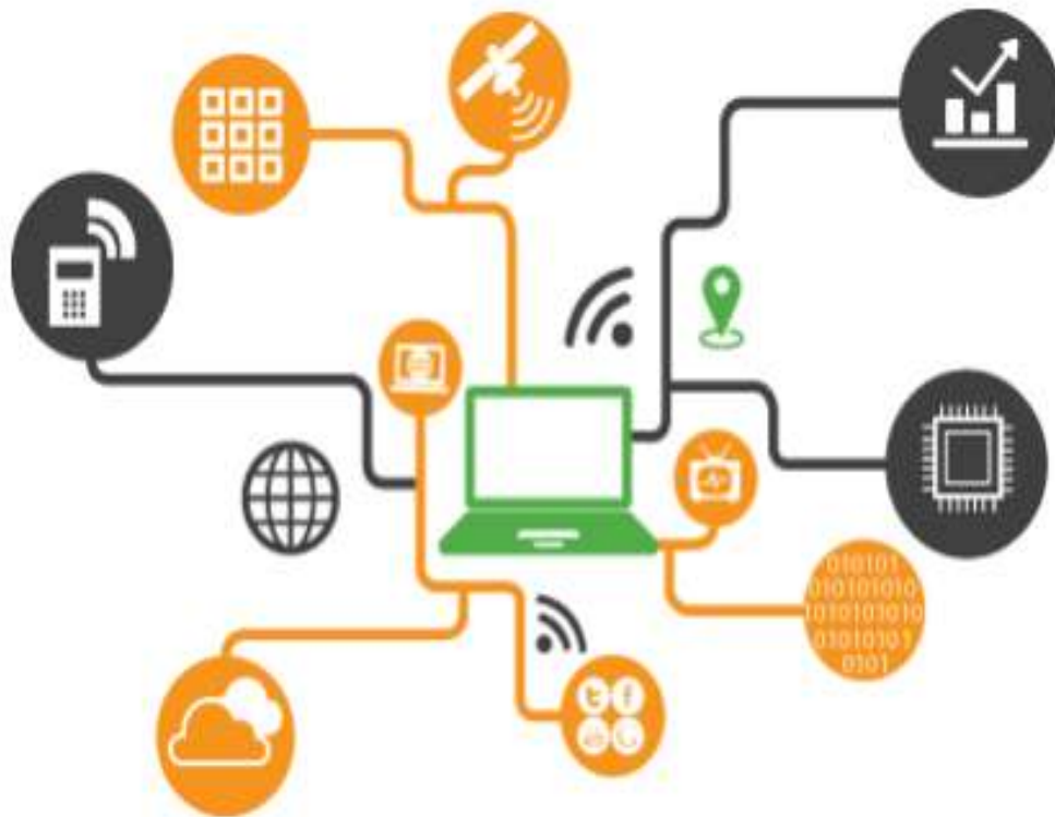
Figure.1 The Conceptual Model of IoT