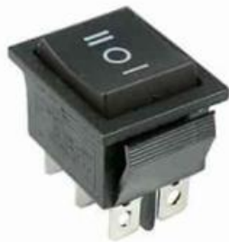
Fig.3: Three Position Control Switch

12V Push switch is used with AC voltage 250V/10A and 125V/15A, which is compatible with both DC and AC. Switch has 3 position control and ideal for DC motors and linear actuators. Three position control switch shown in Fig 3.