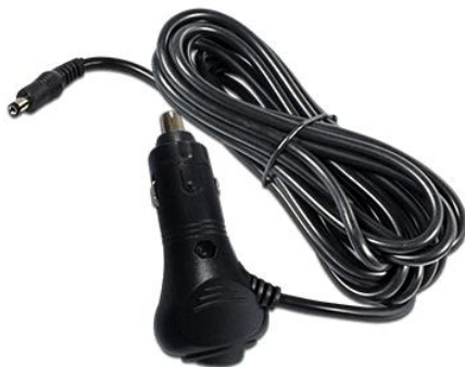
Fig. 4 : 12V DC CAR CHARGER