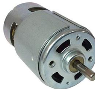
Fig. 2: MOTOR

The DC motor is the mechanism that provides direct current into mechanical action. It is based on the Lorentz rule , which states that "the current transportation conductor in an electrical and magnetic field observations force."Fig.2, shows Motor attached to the frame.