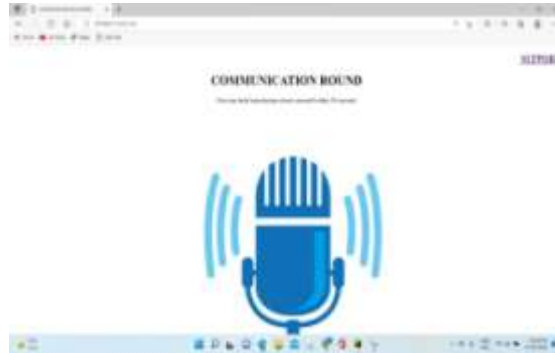
FIG 9.4 Communication round screen