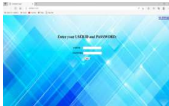
FIG 9.1 Candidate Login screen