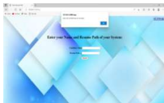
FIG 9.3 Resume Upload Screen