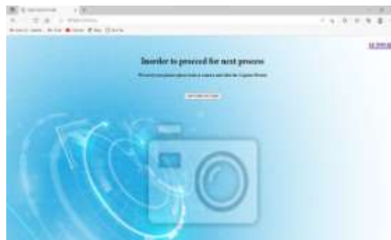
FIG 9.2 Image capturing screen