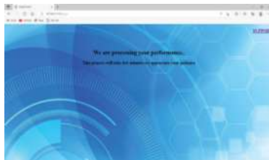
FIG 9.10 Answer Evaluation Process Screen