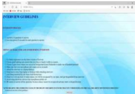
FIG 9.5 Interview Guidelines Screen