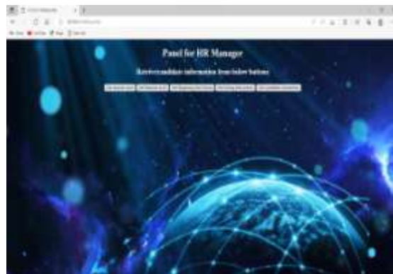
FIG 9.13 HR-Panel Screen