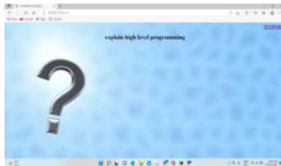
FIG 9.6 Interview Screen