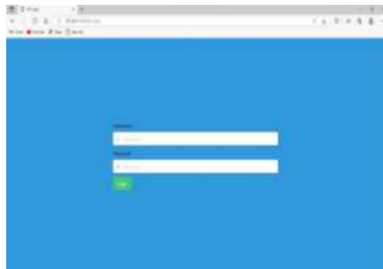
FIG 9.12 HR Login Screen