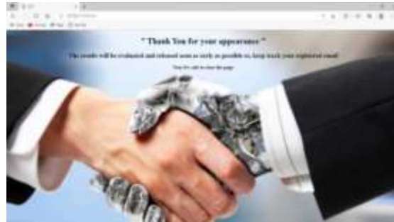
FIG 9.11 Interview Ended Screen