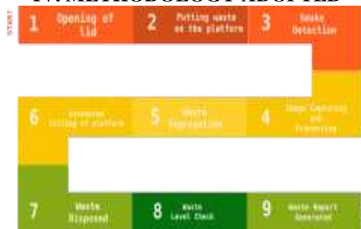
Figure 1: Methodology Adopted

The segregation problem is solved using a supervised learning approach [8]. Firstly, images of cardboard, glass, paper, plastic, metal, and random trash (soda cans) were collected. Each of these categories has around 500 images. Each of the photos was reshaped to 64x64 dimensions and converted to grayscale. This is essential for reshaping that would decrease the time and computational complexity of the neural network. Converting to grayscale allows the network to work with black and white images, and RGB is eliminated. This is implemented considering that the color of the trash is not an essential factor. Once we have the data ready, we create output labels for each dataset class. This is done to predict the output category.