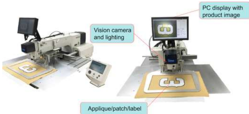
Fig.4. computerized sewing

Sewing Robot (Sewbo): The Sewbo is an industrial robot used in apparel industry for fabric gripping and handling. There have been some experimental trials to sew the whole garment using robots. One such example is Zornow’s robot “Sewbo” which can automatically handle fabric elements during sewing. The robot “Sewbo” invented by Zornow in