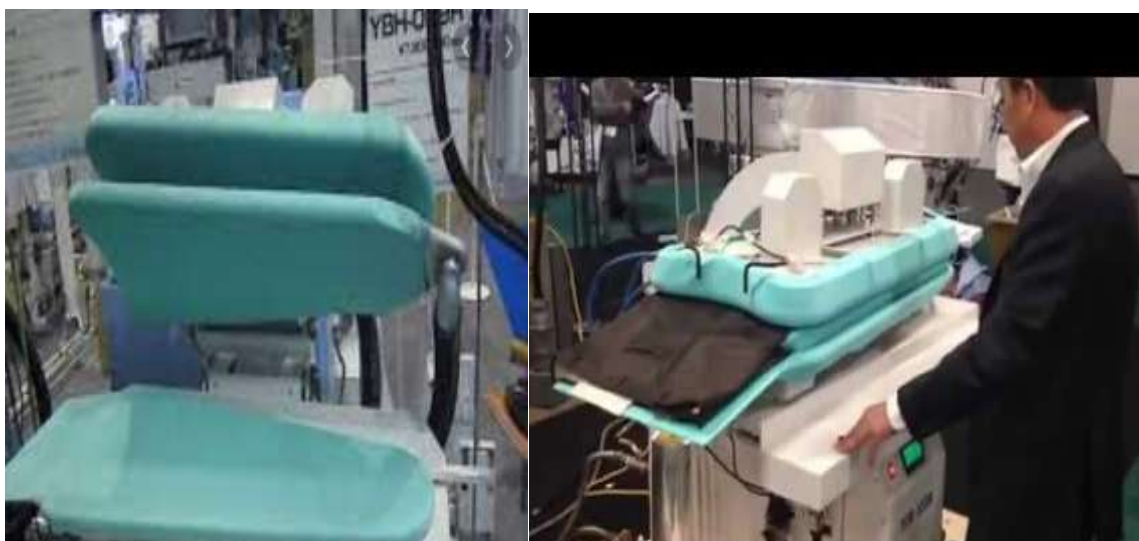
Fig.6. Full automatic ironing machine

workers for pressing operations is always a challenging affair. Operators migrate to other sectors for higher salaries when they gain sufficient skills. As a result, there is a shortage of skilled workers in this sector. These problems can be solved by adopting automation strategies in the pressing sector. Several advanced technologies such as pressing robots, jacket finishers, shirt finishers and shirt pressers are being commercially available now.