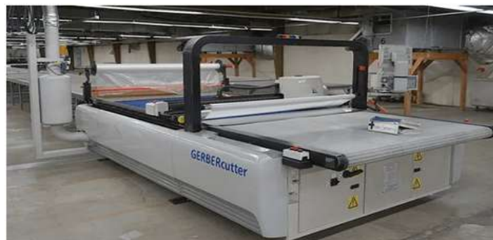
Fig.3. automated fabric cutting

cutting machine automatically cuts multiple layers of fabric together, in a short time and accurately. This cutting process is also done somewhere using laser. The use of automatic cutting machines has reduced both the number of workers and the time compared to manually or operator operated machines.