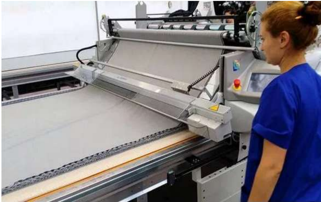
Fig.2. auto mated fabric spreading

Automation in Fabric Cutting: This process was also done manually earlier but now automatic fabric cutting machine is being used. As a result, it is possible to cut the fabric more accurately and smoothly than before. According to the design of the garment now the design of that pattern is saved directly in the computer memory without making marker paper and according to that instruction the