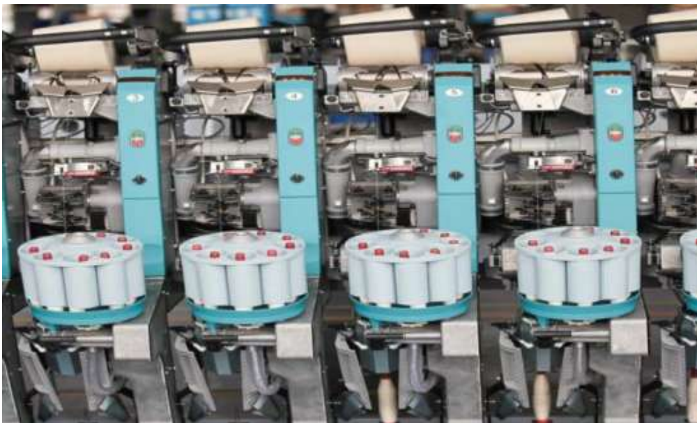
Fig. 1. Robotic auto coner

Robotics in The Splicing in Auto-Coners And Other Winders: Each time there'll be an end break or bobbin change. This joins the yarn ends with a splice that's virtually similar to the yarn. The strength and elongation values of the spliced joint are nearly always comparable, which is quite 90%, with those of the yarn itself. Latest automatic splicer arm is act sort of a robot. It offers even better opening of the yarn ends and a more favourable overlap in splicing zone.