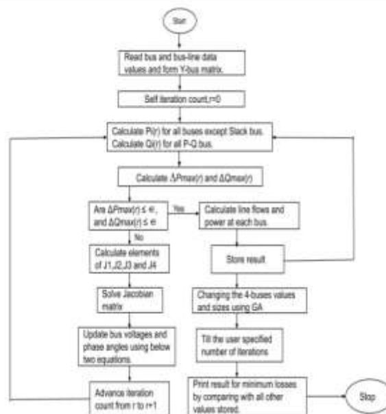
Fig. 2. Optimal sizing and location of DG with GA

algorithm is the survival of the fittest i.e., in the set of data the most compatible is selected if the value has the best chances of giving the best result. Genetic operators exchange information between the peaks, hence reducing the possibility of ending at a local optimum. Power flow