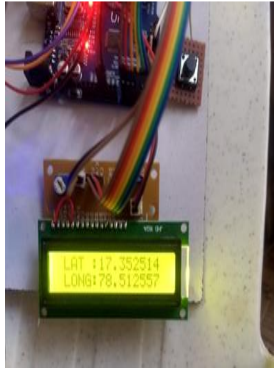
LCD showing 17.3° latitude and 78.5° longitude

In this project we used IOT so that the location can be visible on the webpage. Whenever women is in dangerous situation and feels that she is unsafe, she presses the switch. The buzzer makes sounds there by alerting people present in the surroundings. The latitude and longitude which is received by the GPS is delivered to both the LCD and the GSM modem which will forward the message to the registered mobile number. Immediately after pressing the switch the current location is sent to the concerned person's mobile and police station in the form of message 'I need help' with the current location link and the location is displayed on the webpage using IOT. The current location is updated on the internet. It can be easily operated. Prior knowledge is not required to operate the device. The current location can be traced using applications like Google maps