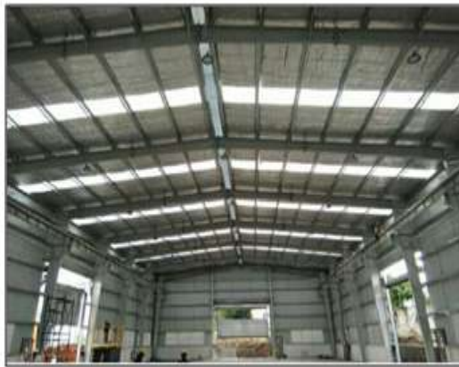
Fig.1 Typical warehouse Structure

being steel siding, supported by means of sidewall or end wall girts. In order to perfectly layout a pre-engineered building, engineers consider the clear span among the bearing factors, bay spacing, roof slope, dead loads, superimposed loads, collateral loads, wind uplift, deflection criteria, internal crane system maximum realistic size and weight of the fabricated members. The use of an optimum least section leads the reduction equipped savings in steel and price reduction.