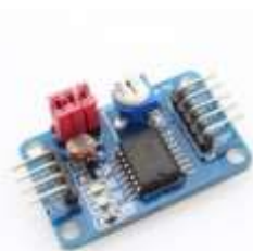
(ACTUAL IMAGE OF PRODUCT)