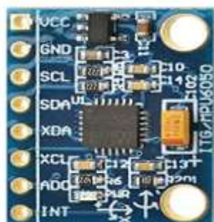
(ACTUAL IMAGE OF PRODUCT)