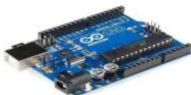
(ACTUAL IMAGE OF PRODUCT)