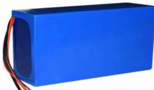
(ACTUAL IMAGE OF THE PRODUCT)