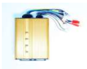
(ACTUAL IMAGE OF THE PRODUCT)