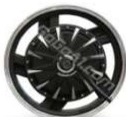
(ACTUAL IMAGE OF THE PRODUCT)