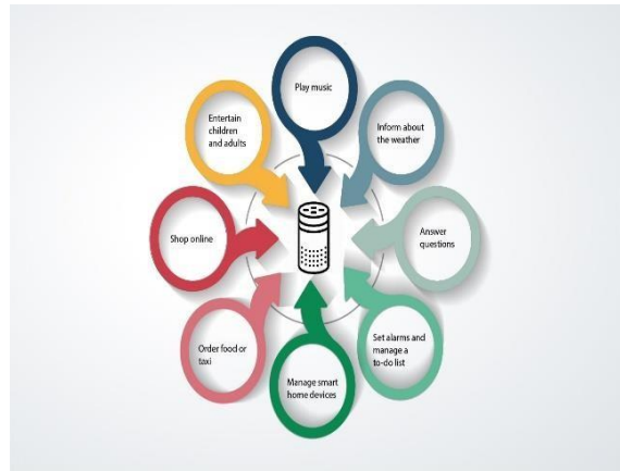
Fig 1: Applications

In the present time Voice has turned into the mainpiece of correspondence. Like, it rushes to handle sound and voice as opposed to message handling, which is the reason voice communication frameworks are tracked down wherever on PC frameworks. Making an interpretation of text into speech is the most common way of making an interpretation of perceived text into any language is shown by the speaker when the text is perused so anyone might hear.