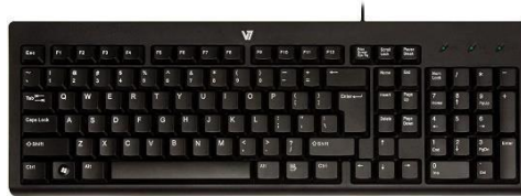
Fig 4: Keyboard

The console goes about as an information connector particularly for engineers, giving admittance to altering program code.