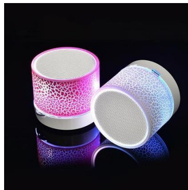
Fig 6: Speaker

The speaker fills the last role in this cycle. When the client characterized question is handled, the result text of that inquiry converted into discourse utilizing an internet-based text to discourse converter. Presently this discourse boisterous result is shipped off the client utilizing sound resultspeakers.