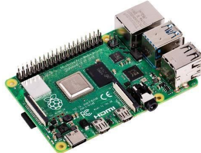
Fig 5: Raspberry Pi