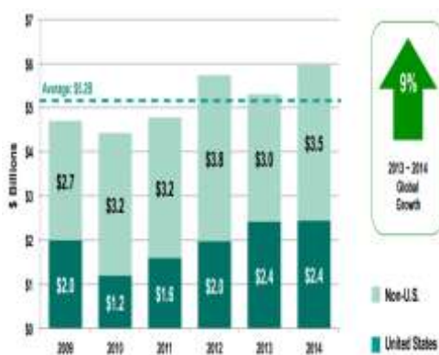
Figur : Growth of new market

As shown in figure, the delivery industry of space is the smallest sector of the global space sector. The whole industry is under the control strictly of the government and the world law, which means companies outside the public sector need to acquire permission to start upload space. All terms and conditions required to obtaining an international license is evident in Hudgins (2002).