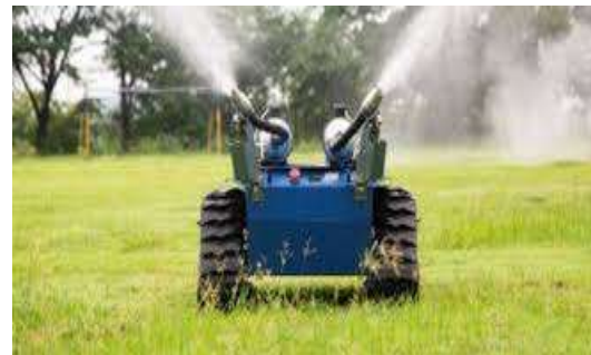
Figure 4.1: Watering (proposed system)

To overcome all the drawbacks of existing system the agrirobot has been proposed. The main aim of agrirobot is applying robotic technology in agricultural fields. This robot efficiently performs seeding, watering, pesticide spraying, Humidity and temperature checking, weather monitoring and Grass cutting. The robot works based on command given by controller. The micro-controller is main part of robot system and entire action is done by micro-controller. And some sensors are used to sense temperature and humidity. For cutting the grass purpose DC cutter motor was placed in front of vehicle.