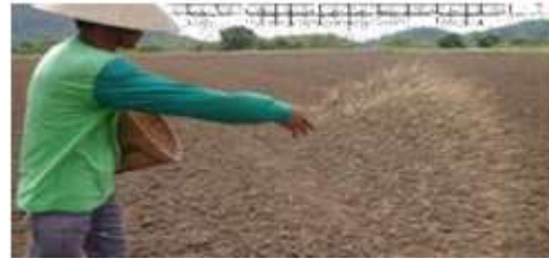
Figure 3.1: Seeding existing system.

Existing Agricultural system depends on human for seeding, watering, pesticide spraying and grass cutting. Traditionally farming is done by human beings with the help of bullock carts. The main problem in agricultural field include lack of labor availability, lack of knowledge regarding soil testing, increasing labor wages, wastage of seeds and more wastage of water. Further some driver less tractors are developed also, but their actual possibility in real scenario is very less. Further some automatic irrigation system has been implemented to reduce human work load. But these methods can't recognize the yield and soil test.