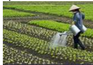
Figure 3.2: watering system.

Then after robots were proposed by researchers. The demand of such robots is high, and it can do single work. And the quantity of production is lesser which makes the available robots expensive, and hence economically tougher for poor farmers to buy it.