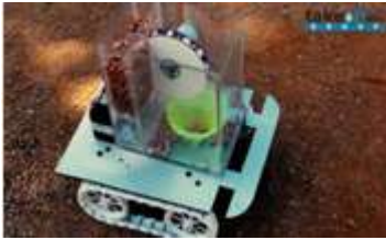
Figure 4.2: Seeding (Proposed system)

The water flows to the sprayer through pipe. The power for pump is regulated by a toggle switch.